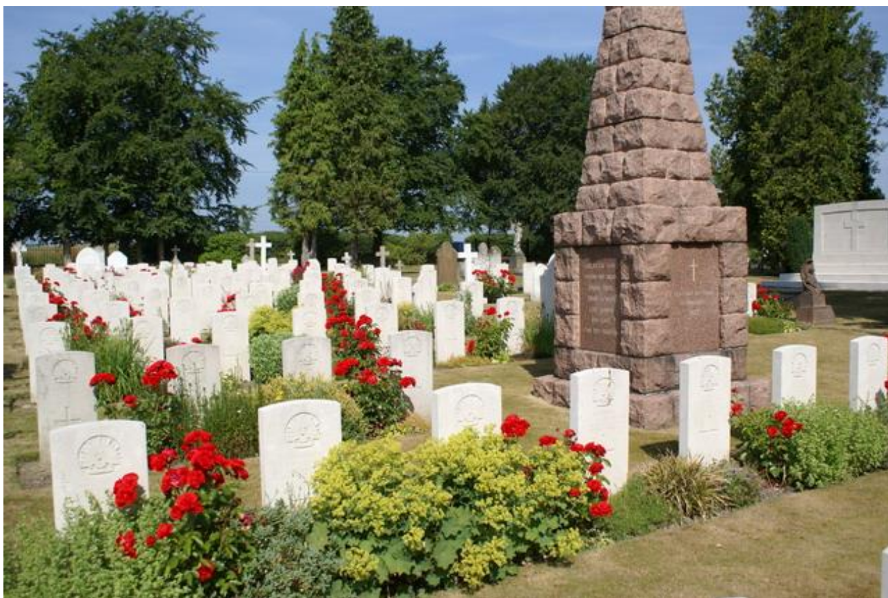
Durrington Cemetery, Wiltshire