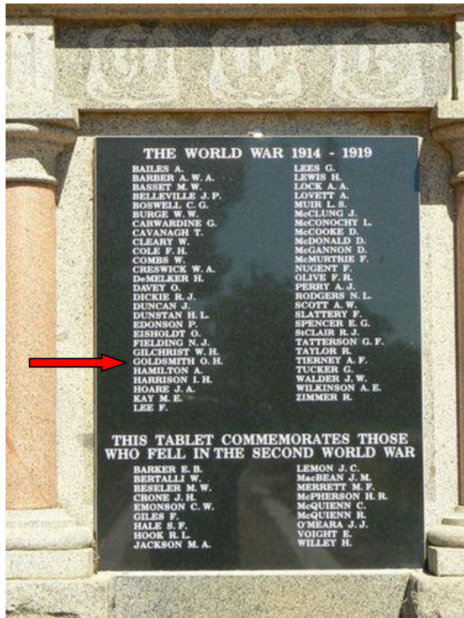
Donald War Memorial