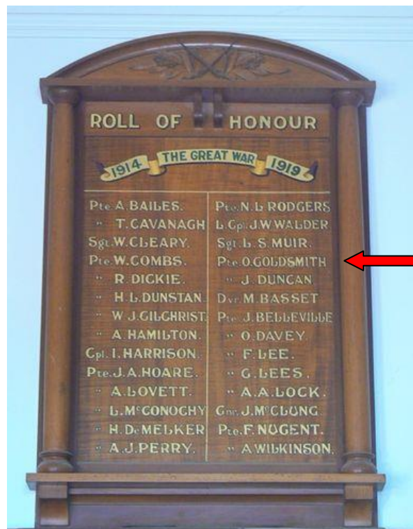
Donald Shire Office Roll of Honour

Pte O. Goldsmith is also remembered on the Donald Shire Office Roll of Honour located at Houston & McCulloch Streets, Shire Offices, Donald, Victoria.